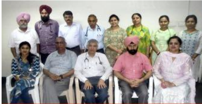
Department of Medicine, PIMS, Jalandhar