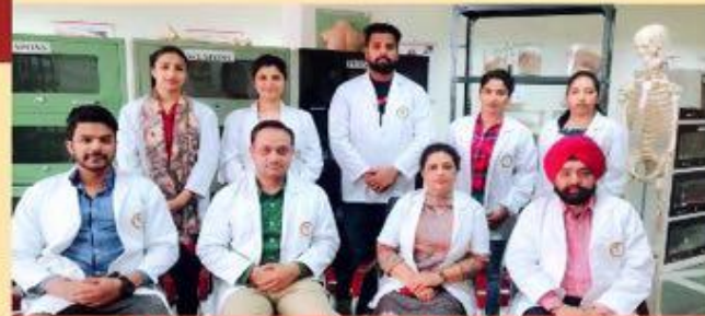
Department of Forensic Medicine & Toxicology, PIMS, Jalandhar

The last date of submitting the abstract is 30th April 2018. Acceptance for the abstract will be emailed after the same has been reviewed by the scientific committee.